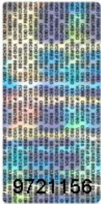
HSL Holographic Tampering Evident Label

If for any reason one or more tamper-evident label is missing, appears disrupted, or looks different than the example shown here, please call HSL Technical Support and avoid using that product.